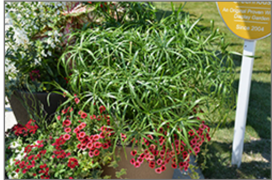
Baby Tut Umbrella Grass