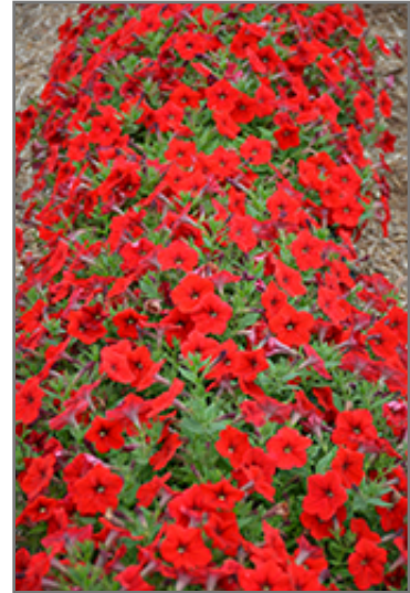
Easy Wave Red Petunia in bloom

Easy Wave Red Petunia is a fine choice for the garden, but it is also a good selection for planting in outdoor containers and hanging baskets. Because of its trailing habit of growth, it is ideally suited for use as a 'spiller' in the 'spiller-thriller-filler' container combination; plant it near the edges where it can spill gracefully over the pot. Note that when growing plants in outdoor containers and baskets, they may require more frequent waterings than they would in the yard or garden.