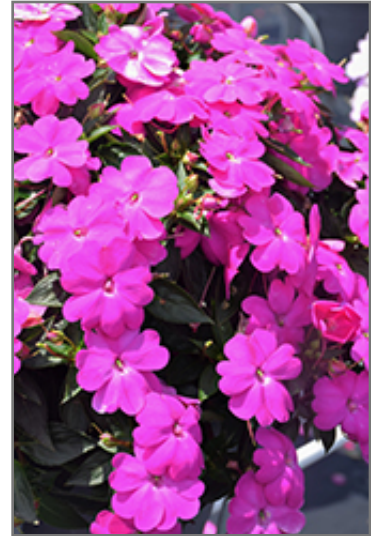
SunPatiens Compact Lilac New Guinea Impatiens flowers

SunPatiens Compact Lilac New Guinea Impatiens is a dense herbaceous annual with a mounded form. Its medium texture blends into the garden, but can always be balanced by a couple of finer or coarser plants for an effective composition.