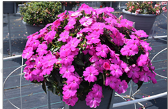
SunPatiens Compact Lilac New Guinea Impatiens in bloom