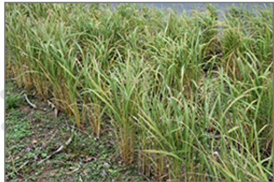
Asian Rice