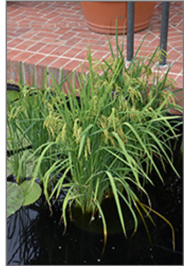
Asian Rice in bloom