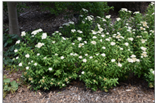
Japanese White Spirea in bloom