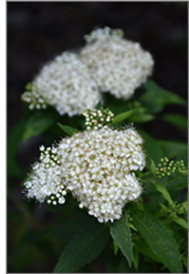
Japanese White Spirea flowers

Japanese White Spirea is recommended for the following landscape applications;