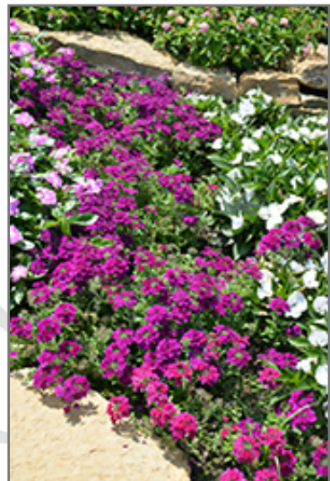
Superbena Royale Plum Wine Verbena in bloom