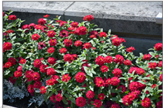
Profusion Double Hot Cherry Zinnia in bloom