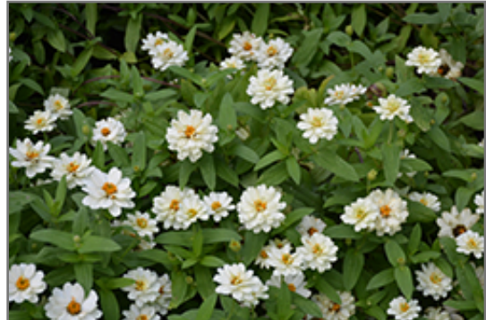
Profusion Double White Zinnia flowers

Profusion Double White Zinnia is recommended for the following landscape applications;