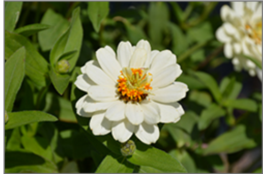
Profusion Double White Zinnia flowers

Profusion Double White Zinnia will grow to be about 14 inches tall at maturity, with a spread of 18 inches. When grown in masses or used as a bedding plant, individual plants should be spaced approximately 14 inches apart. Its foliage tends to remain dense right to the ground, not requiring facer plants in front. This fast-growing annual will normally live for one full growing season, needing replacement the following year.