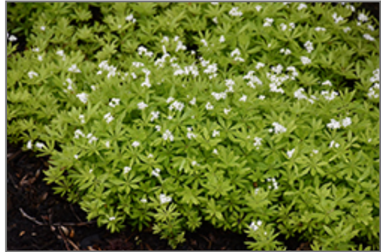
Sweet Woodruff in bloom

This plant does best in partial shade to shade. It prefers to grow in average to moist conditions, and shouldn't be allowed to dry out. It is not particular as to soil type, but has a definite preference for acidic soils. It is somewhat tolerant of urban pollution. This species is not originally from North America. It can be propagated by division.