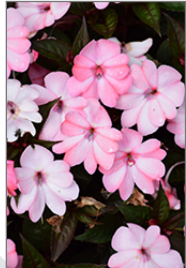
SunPatiens Compact Blush Pink New Guinea Impatiens flowers