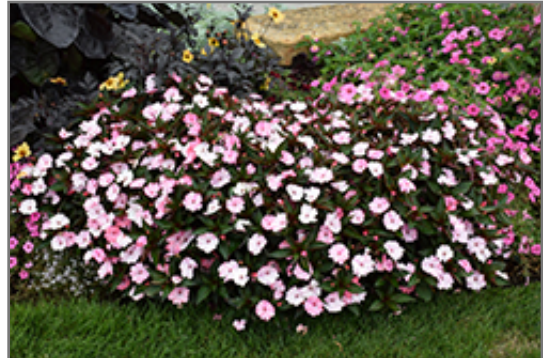
SunPatiens Compact Blush Pink New Guinea Impatiens in bloom

SunPatiens Compact Blush Pink New Guinea Impatiens is a dense herbaceous annual with a mounded form. Its medium texture blends into the garden, but can always be balanced by a couple of finer or coarser plants for an effective composition.