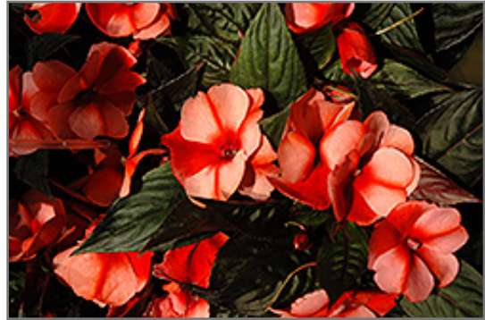
Harmony Salmon Cream New Guinea Impatiens flowers

This plant will require occasional maintenance and upkeep, and should not require much pruning, except when necessary, such as to remove dieback. It is a good choice for attracting bees and butterflies to your yard. It has no significant negative characteristics.