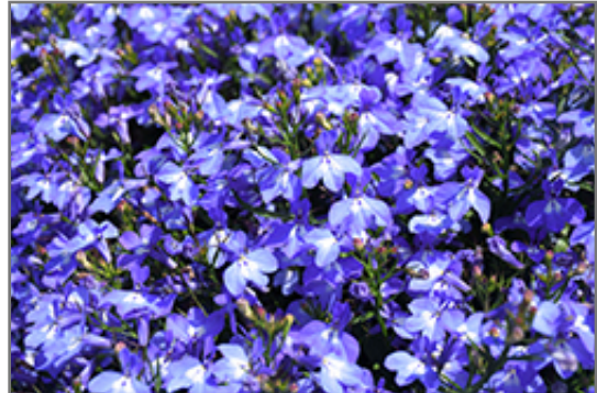
Techno Light Blue Lobelia flowers

Techno Light Blue Lobelia is recommended for the following landscape applications;