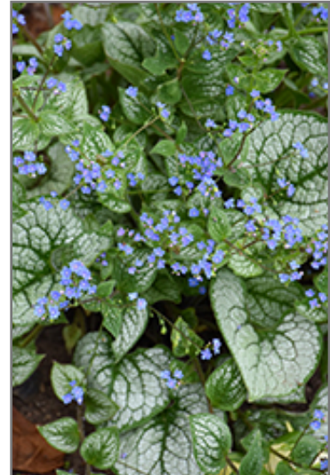
Sea Heart Bugloss flowers

Sea Heart Bugloss is recommended for the following landscape applications;