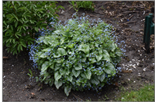
Sea Heart Bugloss in bloom

Sea Heart Bugloss will grow to be about 12 inches tall at maturity extending to 16 inches tall with the flowers, with a spread of 18 inches. When grown in masses or used as a bedding plant, individual plants should be spaced approximately 14 inches apart. It grows at a medium rate, and under ideal conditions can be expected to live for approximately 10 years. As an herbaceous perennial, this plant will usually die back to the crown each winter, and will regrow from the base each spring. Be careful not to disturb the crown in late winter when it may not be readily seen!