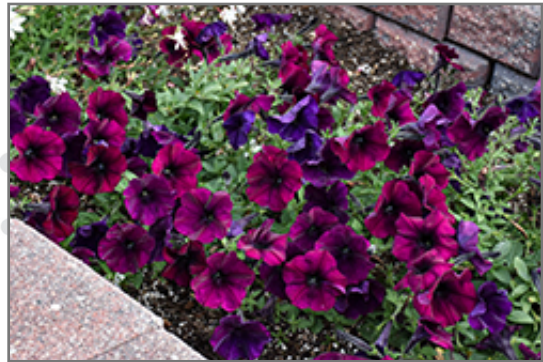
Easy Wave Burgundy Velour Petunia flowers