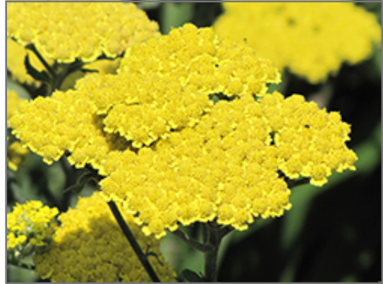
Moonshine Yarrow flowers