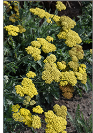
Moonshine Yarrow flowers

Moonshine Yarrow will grow to be about 24 inches tall at maturity, with a spread of 24 inches. It grows at a fast rate, and under ideal conditions can be expected to live for approximately 10 years. As an herbaceous perennial, this plant will usually die back to the crown each winter, and will regrow from the base each spring. Be careful not to disturb the crown in late winter when it may not be readily seen!