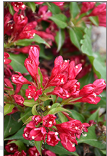
Crimson Kisses Weigela flowers