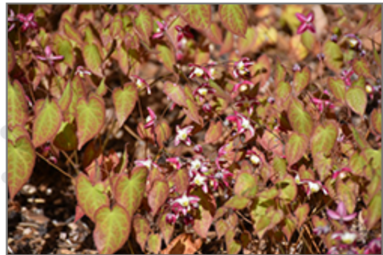
Bishop's Hat in bloom