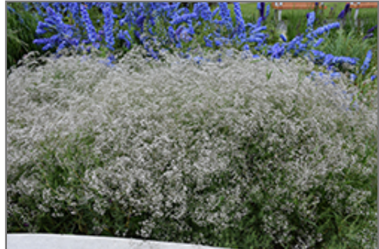
Common Baby's Breath in bloom