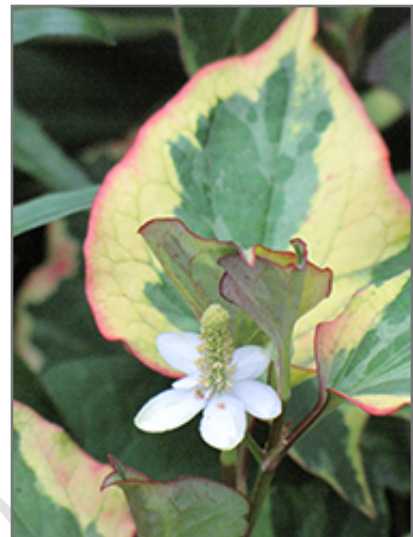
Chameleon Houttuynia flowers