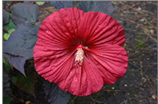
Summerific Holy Grail Hibiscus flowers

Summerific Holy Grail Hibiscus is an herbaceous perennial with an upright spreading habit of growth. Its relatively coarse texture can be used to stand it apart from other garden plants with finer foliage.