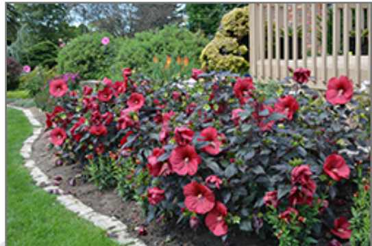
Summerific Holy Grail Hibiscus in bloom