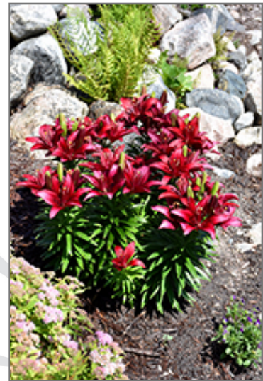
Lily Looks Tiny Rocket Lily in bloom