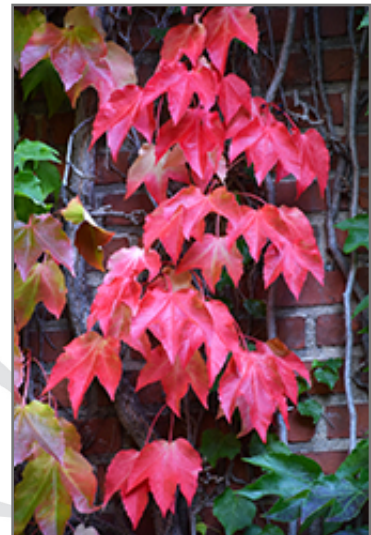
Boston Ivy in fall