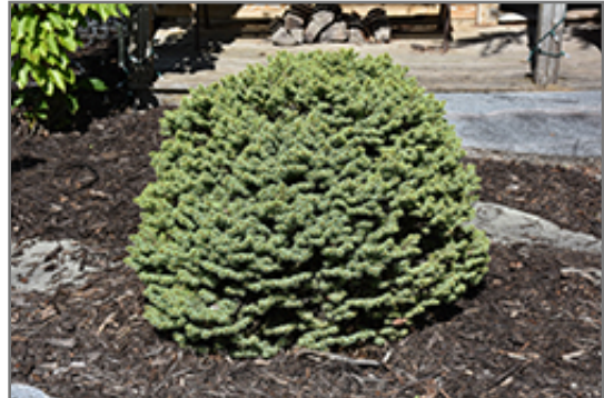
Dwarf Serbian Spruce

Dwarf Serbian Spruce is recommended for the following landscape applications;