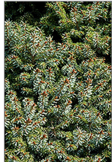
Dwarf Serbian Spruce foliage