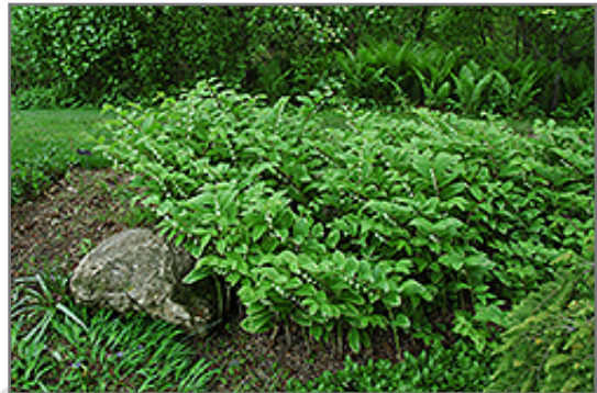
Variegated Solomon's Seal in bloom