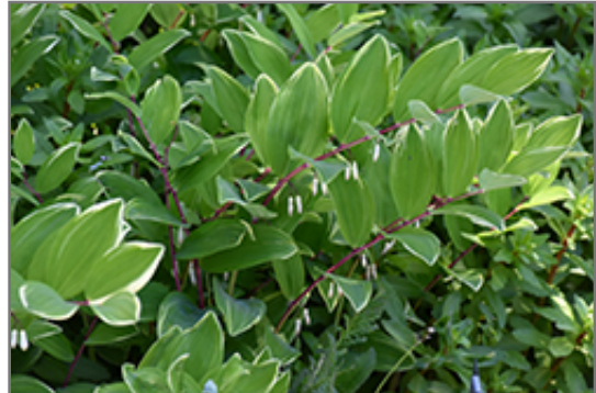
Variegated Solomon's Seal flowers