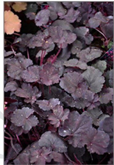
Black Forest Cake Coral Bells foliage