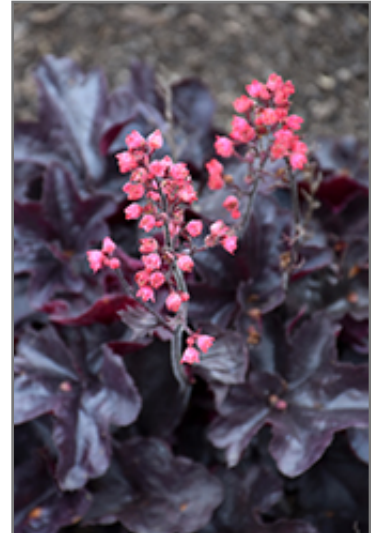
Black Forest Cake Coral Bells flowers

Black Forest Cake Coral Bells is recommended for the following landscape applications;