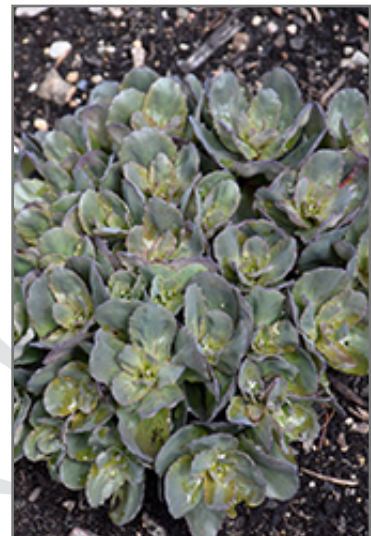
Rock 'N Grow Back in Black Stonecrop foliage