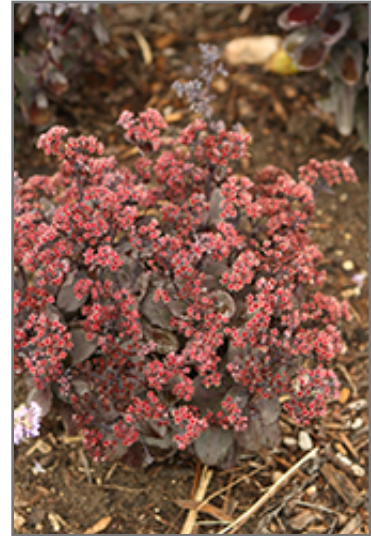
Rock 'N Grow Back in Black Stonecrop flowers

Rock 'N Grow Back in Black Stonecrop is a fine choice for the garden, but it is also a good selection for planting in outdoor pots and containers. With its upright habit of growth, it is best suited for use as a 'thriller' in the 'spiller-thriller-filler' container combination; plant it near the center of the pot, surrounded by smaller plants and those that spill over the edges. Note that when growing plants in outdoor containers and baskets, they may require more frequent waterings than they would in the yard or garden. Be aware that in our climate, most plants cannot be expected to survive the winter if left in containers outdoors, and this plant is no exception. Contact our experts for more information on how to protect it over the winter months.