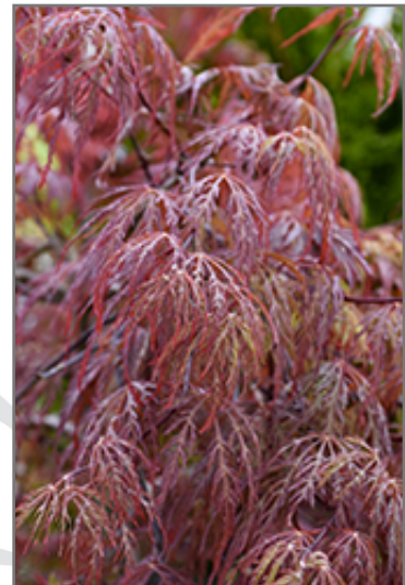
Velvet Viking Japanese Maple foliage