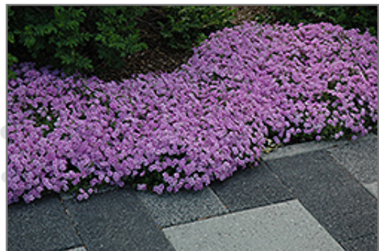
Fort Hill Moss Phlox in bloom