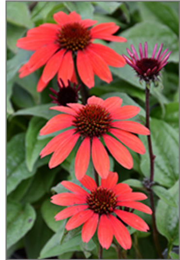
Panama Red Coneflower flowers

Panama Red Coneflower will grow to be about 10 inches tall at maturity extending to 14 inches tall with the flowers, with a spread of 10 inches. Its foliage tends to remain low and dense right to the ground. It grows at a medium rate, and under ideal conditions can be expected to live for approximately 10 years. As an herbaceous perennial, this plant will usually die back to the crown each winter, and will regrow from the base each spring. Be careful not to disturb the crown in late winter when it may not be readily seen!