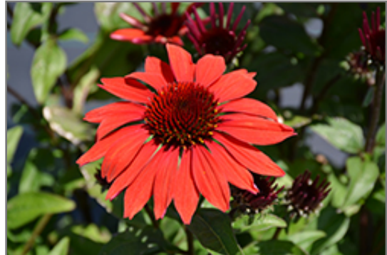
Panama Red Coneflower flowers

This is a relatively low maintenance plant, and is best cleaned up in early spring before it resumes active growth for the season. It is a good choice for attracting birds and butterflies to your yard, but is not particularly attractive to deer who tend to leave it alone in favor of tastier treats. It has no significant negative characteristics.