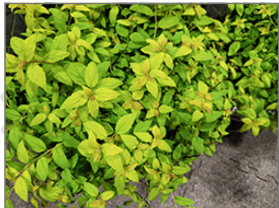
Little Spark Spirea foliage