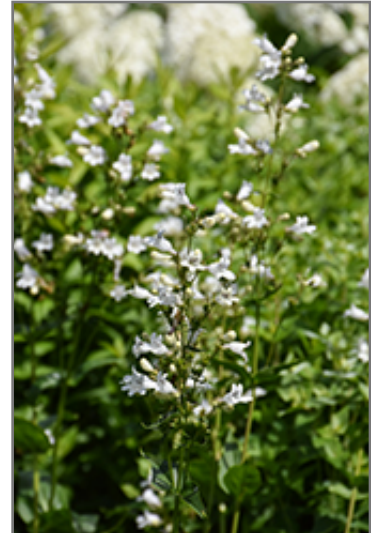
Foxglove Beardtongue flowers

Foxglove Beardtongue is recommended for the following landscape applications;