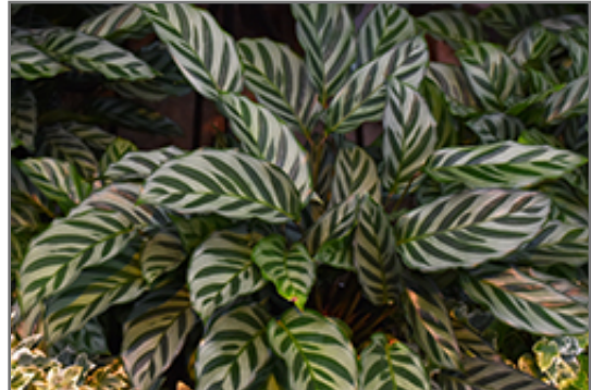
Color Full Makoyana Peacock Plant foliage

This is an herbaceous houseplant with an upright spreading habit of growth. Its relatively coarse texture stands it apart from other indoor plants with finer foliage. This plant should not require much pruning, except when necessary to keep it looking its best.