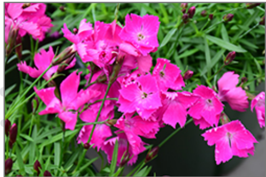
Beauties Kahori Pinks flowers