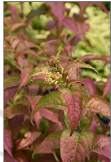
Firefly Diervilla flowers