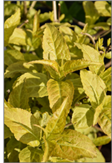
Firefly Diervilla foliage

Firefly Diervilla makes a fine choice for the outdoor landscape, but it is also well-suited for use in outdoor pots and containers. Because of its height, it is often used as a 'thriller' in the 'spiller-thriller-filler' container combination; plant it near the center of the pot, surrounded by smaller plants and those that spill over the edges. It is even sizeable enough that it can be grown alone in a suitable container. Note that when grown in a container, it may not perform exactly as indicated on the tag - this is to be expected. Also note that when growing plants in outdoor containers and baskets, they may require more frequent waterings than they would in the yard or garden. Be aware that in our climate, most plants cannot be expected to survive the winter if left in containers outdoors, and this plant is no exception. Contact our experts for more information on how to protect it over the winter months.