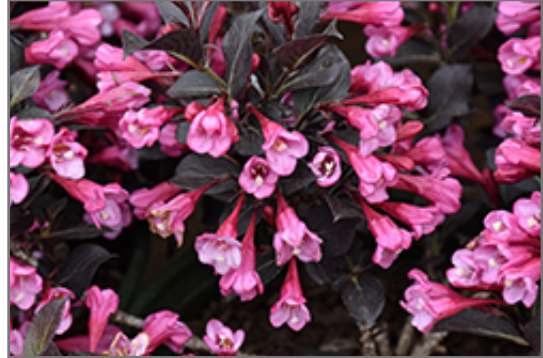
Coco Chill Weigela flowers

This shrub will require occasional maintenance and upkeep, and should only be pruned after flowering to avoid removing any of the current season's flowers. It is a good choice for attracting hummingbirds to your yard. It has no significant negative characteristics.