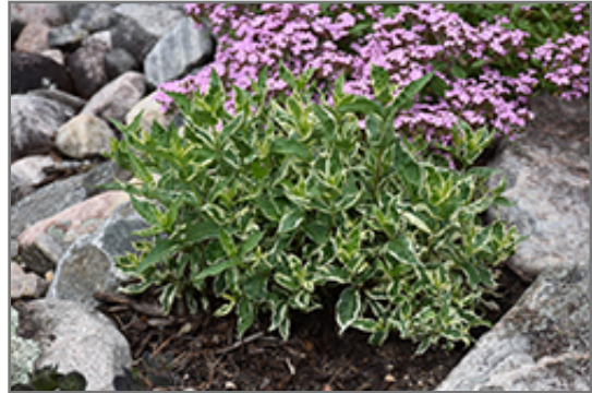
Cool Splash Bush Honeysuckle