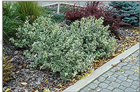
Cool Splash Bush Honeysuckle