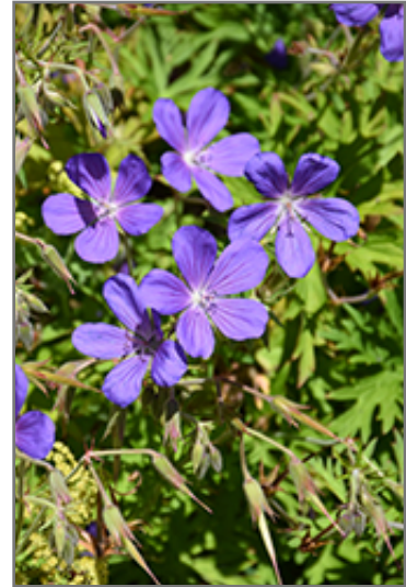
Orion Cranesbill flowers