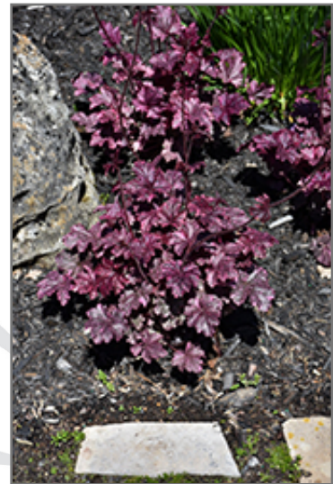
Midnight Rose Coral Bells