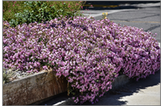
Max Frei Soapwort in bloom

Max Frei Soapwort will grow to be about 8 inches tall at maturity extending to 12 inches tall with the flowers, with a spread of 12 inches. When grown in masses or used as a bedding plant, individual plants should be spaced approximately 10 inches apart. It grows at a medium rate, and under ideal conditions can be expected to live for approximately 10 years. As an evergreen perennial, this plant will typically keep its form and foliage year-round.