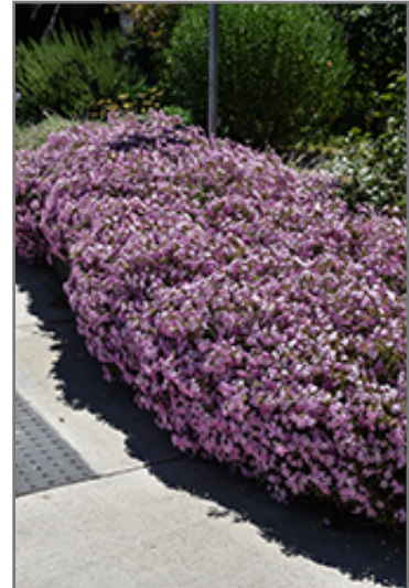
Max Frei Soapwort in bloom

This plant will require occasional maintenance and upkeep, and should only be pruned after flowering to avoid removing any of the current season's flowers. It is a good choice for attracting hummingbirds to your yard. It has no significant negative characteristics.