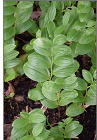
Solomon's Seal foliage

Solomon's Seal is recommended for the following landscape applications;