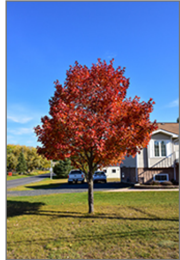
Northwood Red Maple in fall