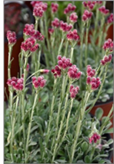
Red Pussytoes flowers

Red Pussytoes is recommended for the following landscape applications;