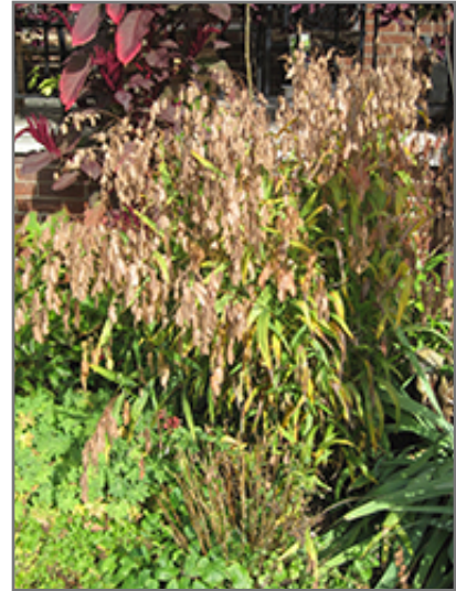
Northern Sea Oats

Northern Sea Oats is a fine choice for the garden, but it is also a good selection for planting in outdoor pots and containers. Because of its height, it is often used as a 'thriller' in the 'spiller-thriller-filler' container combination; plant it near the center of the pot, surrounded by smaller plants and those that spill over the edges. It is even sizeable enough that it can be grown alone in a suitable container. Note that when growing plants in outdoor containers and baskets, they may require more frequent waterings than they would in the yard or garden. Be aware that in our climate, most plants cannot be expected to survive the winter if left in containers outdoors, and this plant is no exception. Contact our experts for more information on how to protect it over the winter months.