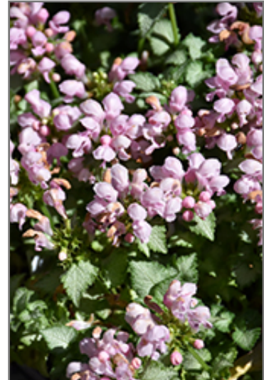
Pink Pewter Spotted Dead Nettle flowers

Pink Pewter Spotted Dead Nettle is recommended for the following landscape applications;