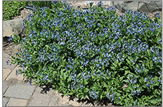
Blue Ice Star Flower in bloom

This plant does best in full sun to partial shade. It prefers to grow in average to moist conditions, and shouldn't be allowed to dry out. It is not particular as to soil type or pH. It is quite intolerant of urban pollution, therefore inner city or urban streetside plantings are best avoided. This is a selection of a native North American species. It can be propagated by cuttings; however, as a cultivated variety, be aware that it may be subject to certain restrictions or prohibitions on propagation.