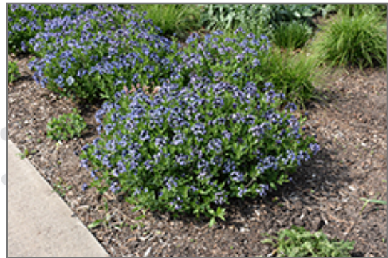
Blue Ice Star Flower in bloom